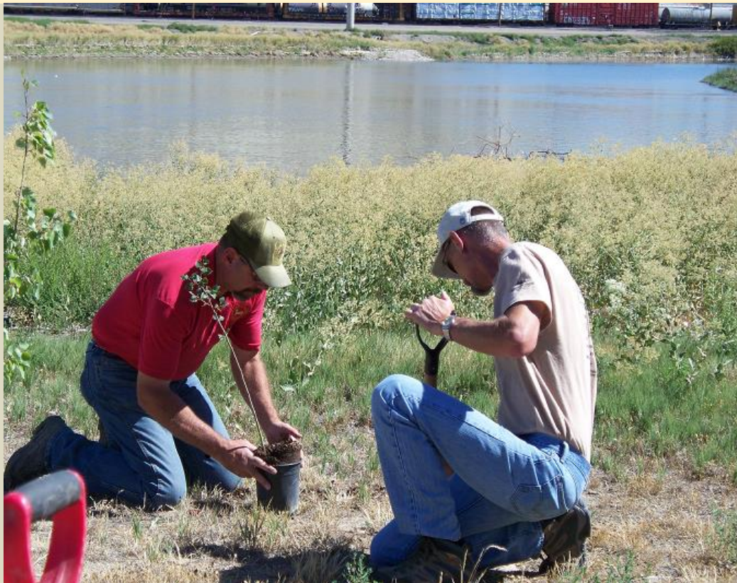
Planting Aspens along the Green River Trout Unlimited 2014 River Walk Festival