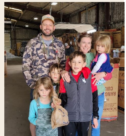
Family bringing in recyclables for trees

Tree Species included: Chokecherry, Nanking Cherry, Three Leaf Sumac, Ponderosa Pine, and Rocky Mountain Juniper.