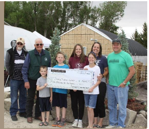
SWCCD Supervisors and Simply Sunshine/Woodward Family

FFA grant funds will be used for an agriculture facility to include barns, and stables for pigs, sheep, goats and cows as well as a greenhouse. Simply Sunshine Nursery will be using their grant funds for a soil mixer.