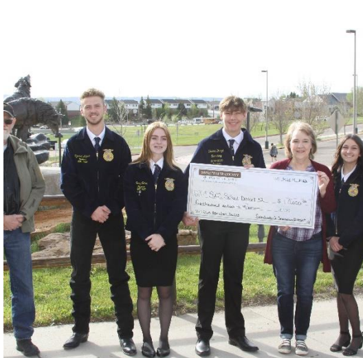
FFA Grant Recipients

This grant assists implementing best management practices in the Bitter Creek Watershed to help with mitigating E. coli concentrations.