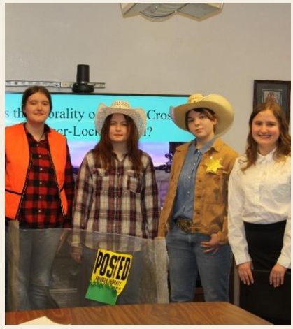
Green River FFA students presenting a Corner Crossing Debate at the SWCCD Office

The Green River FFA Chapter was named Chapter of the Year at the Wyoming State Convention. Green River had several students and teams finish in the top 10 in their contests. Green River students were excited at their level of success during the competition. One of the teams gave a presentation at the SWCCD Office and we congratulate all of the winners.